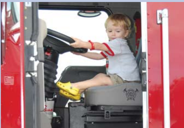
The Clipper is published for friends and supporters of Gulf Coast Community College and the Gulf Coast Community College Foundation, Inc. Children and their parents flocked to the First Annual Fire Prevention Fest held at Gulf Coast Community College on October 9. Area firefighters, emergency personnel, and fire prevention specialists came together to inform the community about fire prevention techniques. Kids at the event enjoyed checking out the fire trucks (above) and getting their picture taken with Smokey the Bear.