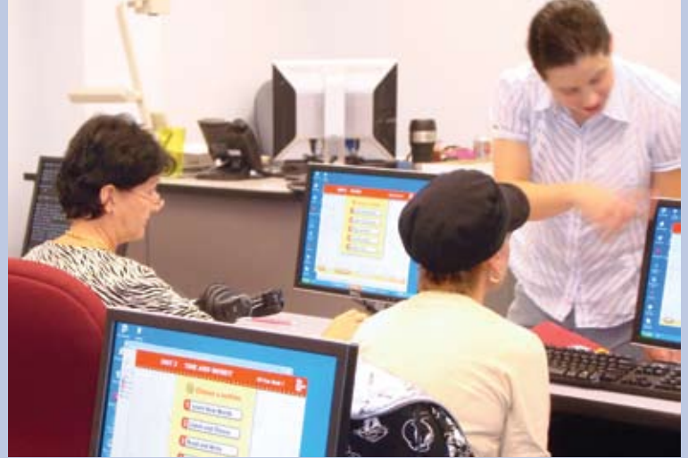
Students get a lot of face-to-face time with their instructors in ESOL.

Since December 2006, the ESOL program at Gulf Coast has seen 57 students graduate based on the Comprehensive Adult Student Assessment System post-test. On average, ESOL has 500 students enroll per semester (250 per eight week session), and the number continues to increase each semester. The number of languages represented in the program varies per quarter, but usually 27-32 different nations are served each session. Some of the most prominent languages served in the ESOL