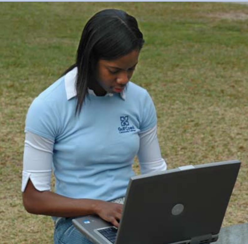
A Gulf Coast student works online while enjoying the beautiful Northwest Florida weather — another E-Learning advantage!

E-Learning is growing based on student demand at an average rate of 15% each semester. Over 75% of those students enrolled in online courses also take face-to-face classes at GCCC, offering them the best of both worlds. The E-Learning program has made education more accessible for all, and helps many students who otherwise might not be able to attend, achieve their goals.