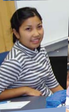
Each semester, approximately 30 countries are represented among ESOL program participants.