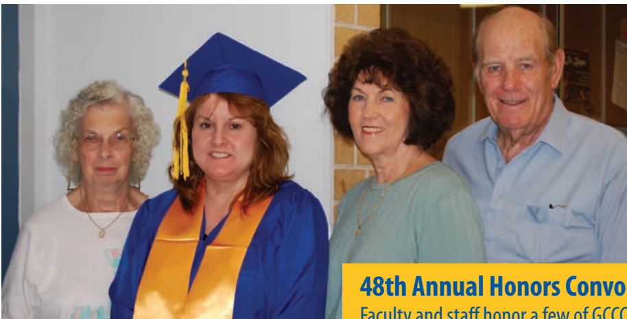
48th Annual Honors Convocation Faculty and staff honor a few of GCCC's finest students with special recognition awards.