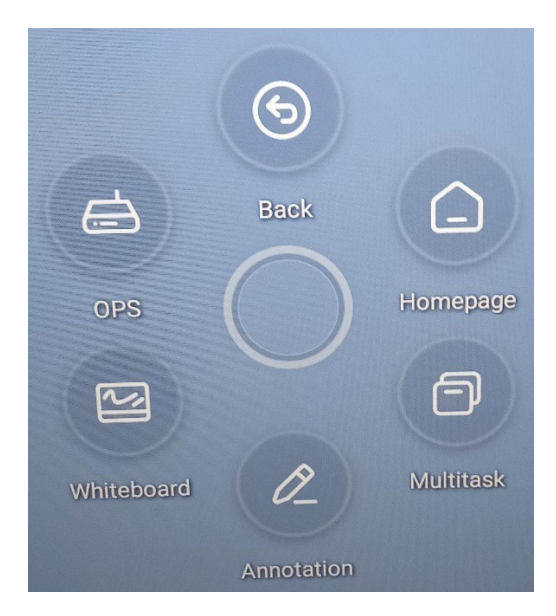
Example of the White Board image:

Additionally, there is a floating circle shortcut icon on the Virtual's screen that will open up many of the same features as the side arrow toolbar. This icon can be moved by pressing and holding, then sliding it across the screen.