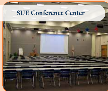
SUE Conference Center

Ask us about catering services too! Choose from a wide variety of menu options from continental breakfast to a full buffet.