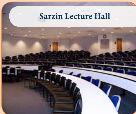
Sarzin Lecture Hall

Call us first! We are your resource for conferences, events and workshops!